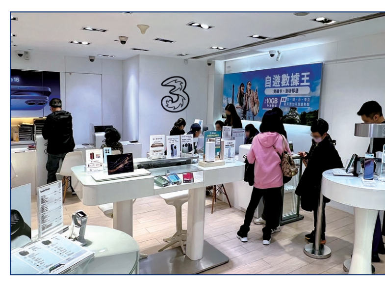
The Group has a strong presence with retail shops located throughout Hong Kong, providing attentive customer service.

In its commitment to popularising 5G applications and driving business growth, the Group aims to achieve energy savings and reduce carbon emissions while maintaining superior customer experience. The Group's efforts have been recognised with awards, marking important milestones as a community-friendly and sustainable enterprise.