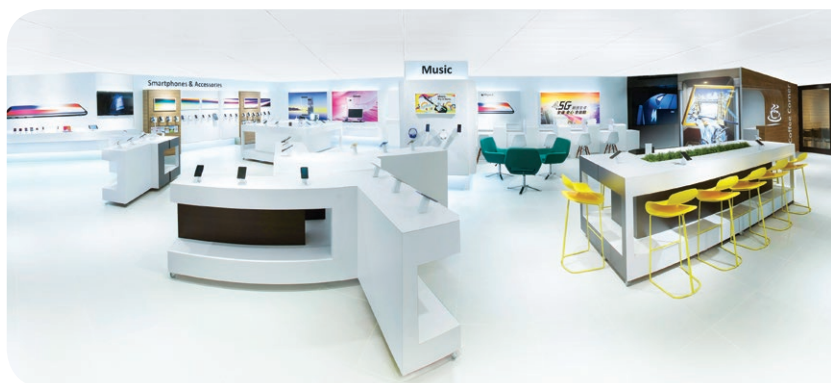
• The 3LIVE flagship store offers customers a wide variety of telecoms products and services.

The Group is primarily engaged in provision of advanced mobile services in Hong Kong and Macau under the 3 brand. 3 Hong Kong is the only local operator to own blocks of spectrum across the 900 MHz, 1800 MHz, 2100 MHz, 2300 MHz and 2600 MHz bands.