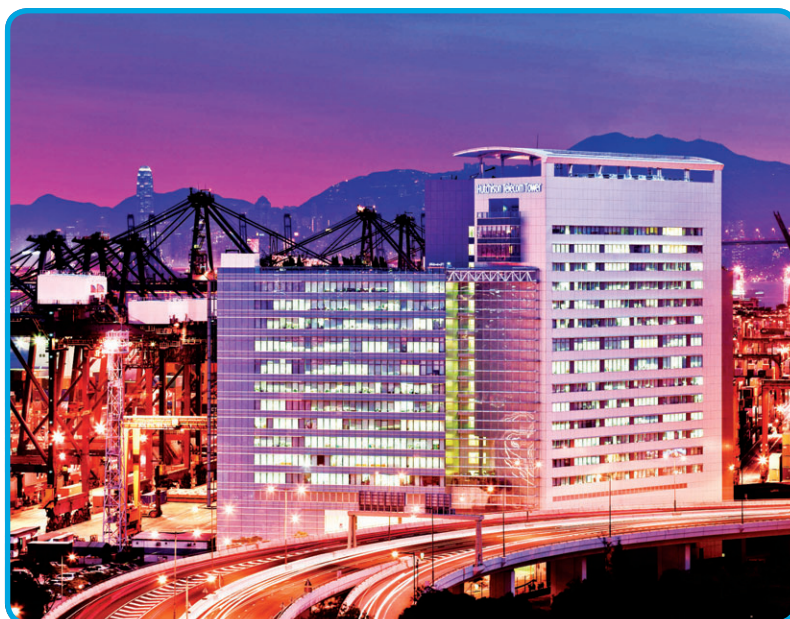
As an integrated telecoms operator, HTHKH combines the strengths of mobile, fixed-line and Wi-Fi networks.

HGC also tailors telecommunications solutions to unique needs and offers the highest-standard data centre facilities to meet demands from corporate and business customers. The carrier-grade network has been extended to serve 1.8 million households in Hong Kong, the majority of which have access to speeds ranging from 100Mbps to 1Gbps.