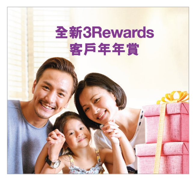
The 3Rewards loyalty scheme delights customers with special treats and privileges.

In 2017, 3 Hong Kong launched the 3Rewards customer loyalty scheme. The Group aims to delight loyal customers with special treats and privileges every year, with a view to strengthening existing relationships and acquiring new customers.