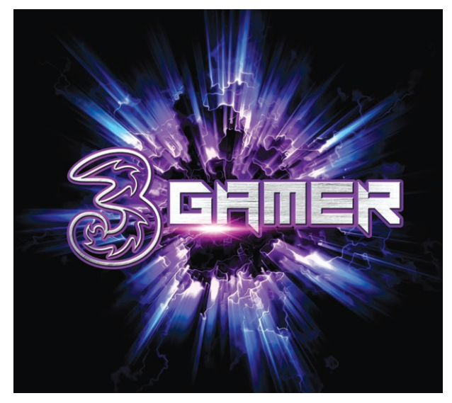
Launch of the "3Gamer" portal enables customers to play thousands of online games from our business partners through a single portal.

The role of mobile operator changes constantly, especially in the IoT era. For example, 3 Hong Kong has entered the gaming market with Razer - the leading lifestyle brand for gamers - to serve a new generation of customers by combining network service excellence with advanced gaming systems. A range of tariff plans bundled with Razer's gaming devices have been tailored to provide a superior gaming experience.