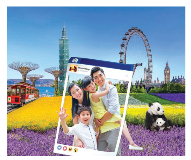
3 Hong Kong offers a variety of roaming packages to suit frequent travellers.

In order to meet the needs of travellers, 3 Hong Kong has introduced a variety of roaming packages including the Roam-in-Command service which covers 21 popular travelling destinations. Customers can roam hassle-free in Europe, the Americas, Greater China and other parts of Asia Pacific.