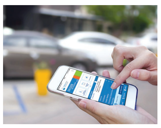
3 Hong Kong offers cutting-edge data, voice and roaming services through far-reaching networks.

The Group is now primarily engaged in provision of advanced mobile services in Hong Kong and Macau under the 3 brand. 3 Hong Kong is the only local operator with rights to utilise blocks of spectrum across the 900MHz, 1800MHz, 2100MHz, 2300MHz and 2600MHz bands.