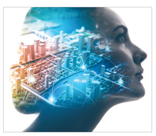
3 Hong Kong promotes NB-IoT technology to sharpen Hong Kong's competitiveness as an innovative city.

Listed on the Main Board of the Stock Exchange, HTHKH is included in various Hang Seng indexes such as the Composite Index, Composite Industry Index – Telecommunications, Composite LargeCap & MidCap Index, Composite MidCap Index, Composite MidCap & SmallCap Index, Corporate Sustainability Benchmark Index, Low Volatility Index and Global Composite Index.