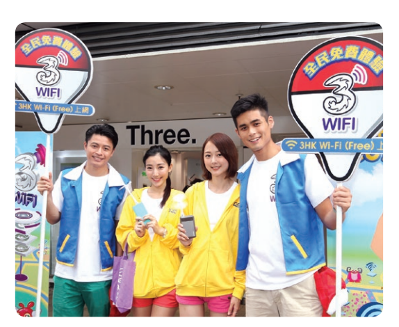
Any local mobile user could enjoy 90 minutes' free daily Wi-Fi service - by courtesy of 3 Hong Kong - from July to September 2016.

3 Hong Kong was one of Asia's first operators to launch VoWi-Fi service with integrated IP Multimedia Subsystem, 4G LTE and Wi-Fi technology, enabling customers to